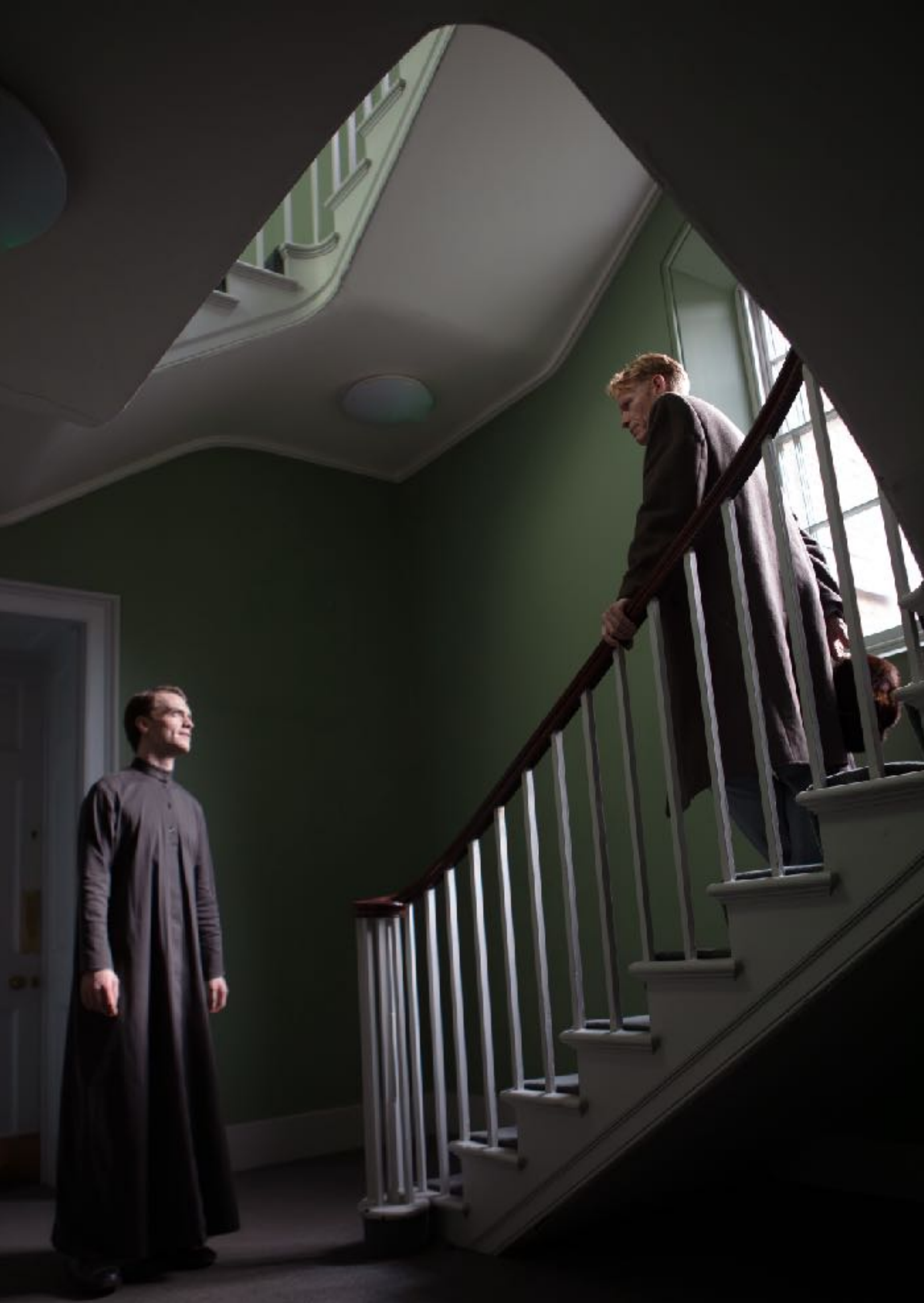
BST for short film "St. Vasily"