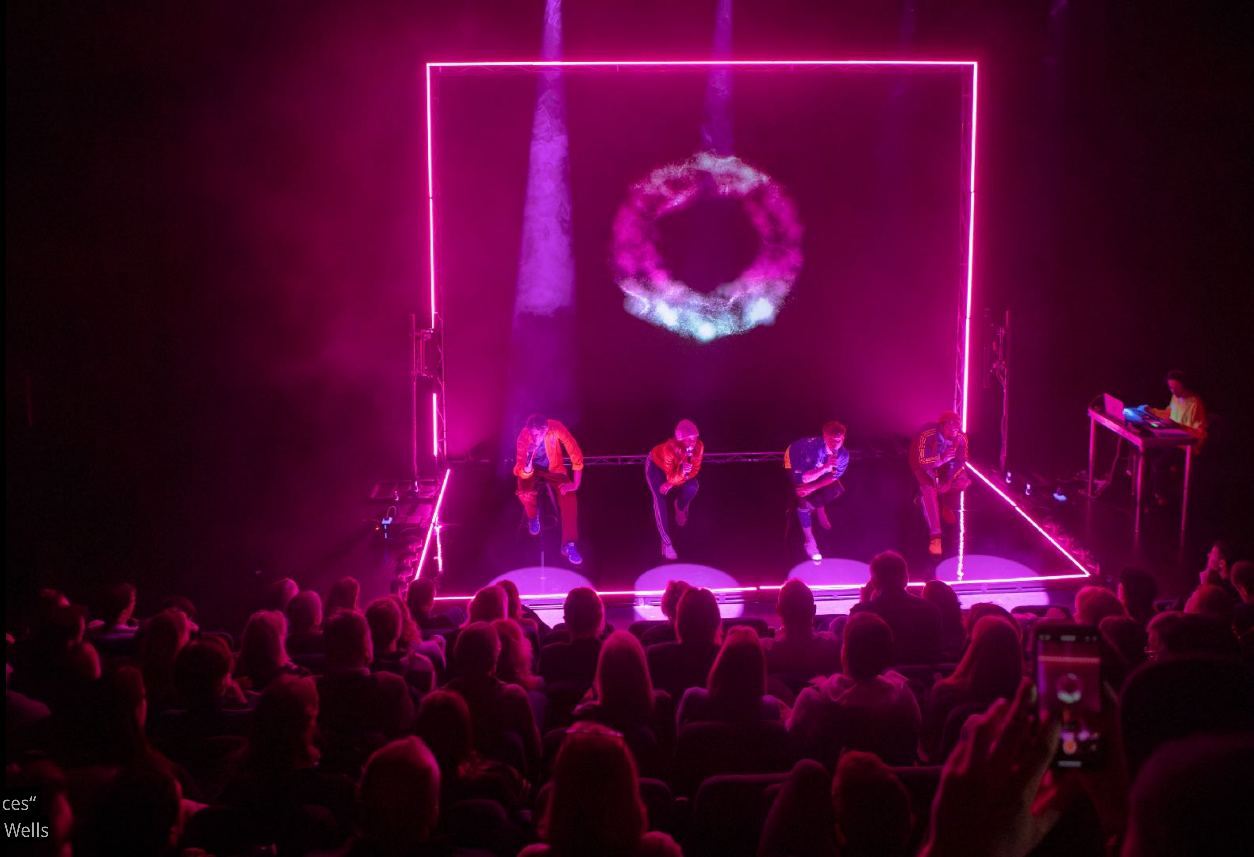
“Mahamaya Electronic Devices” by Ivan Vyrypaev at Sadler Wells