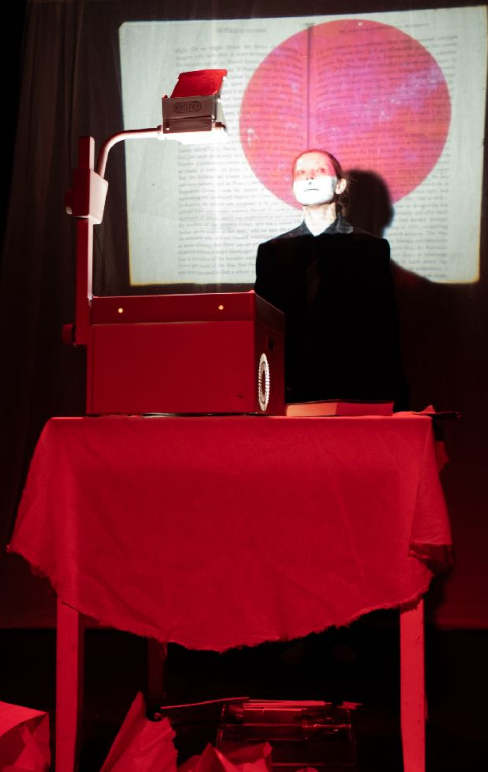
"The World of Yesterday" Stefan Zweig Camden Peoples Theatre