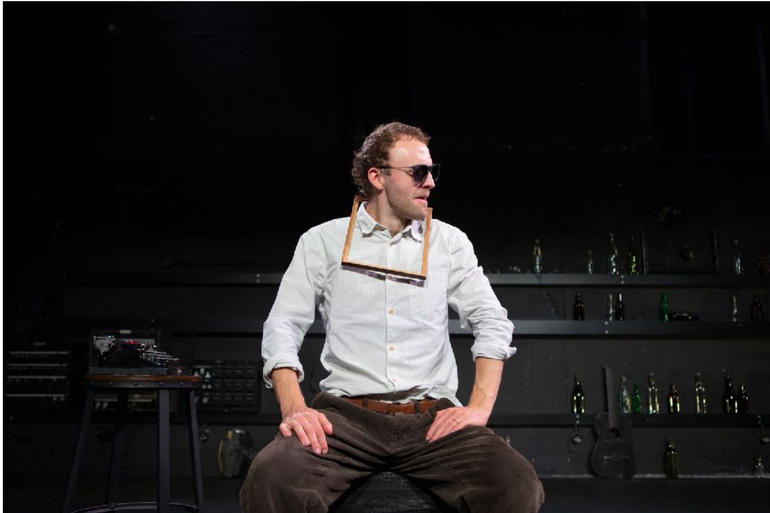
Life with a little "L" six short stories from Charles Bukowski Riverside Studios London