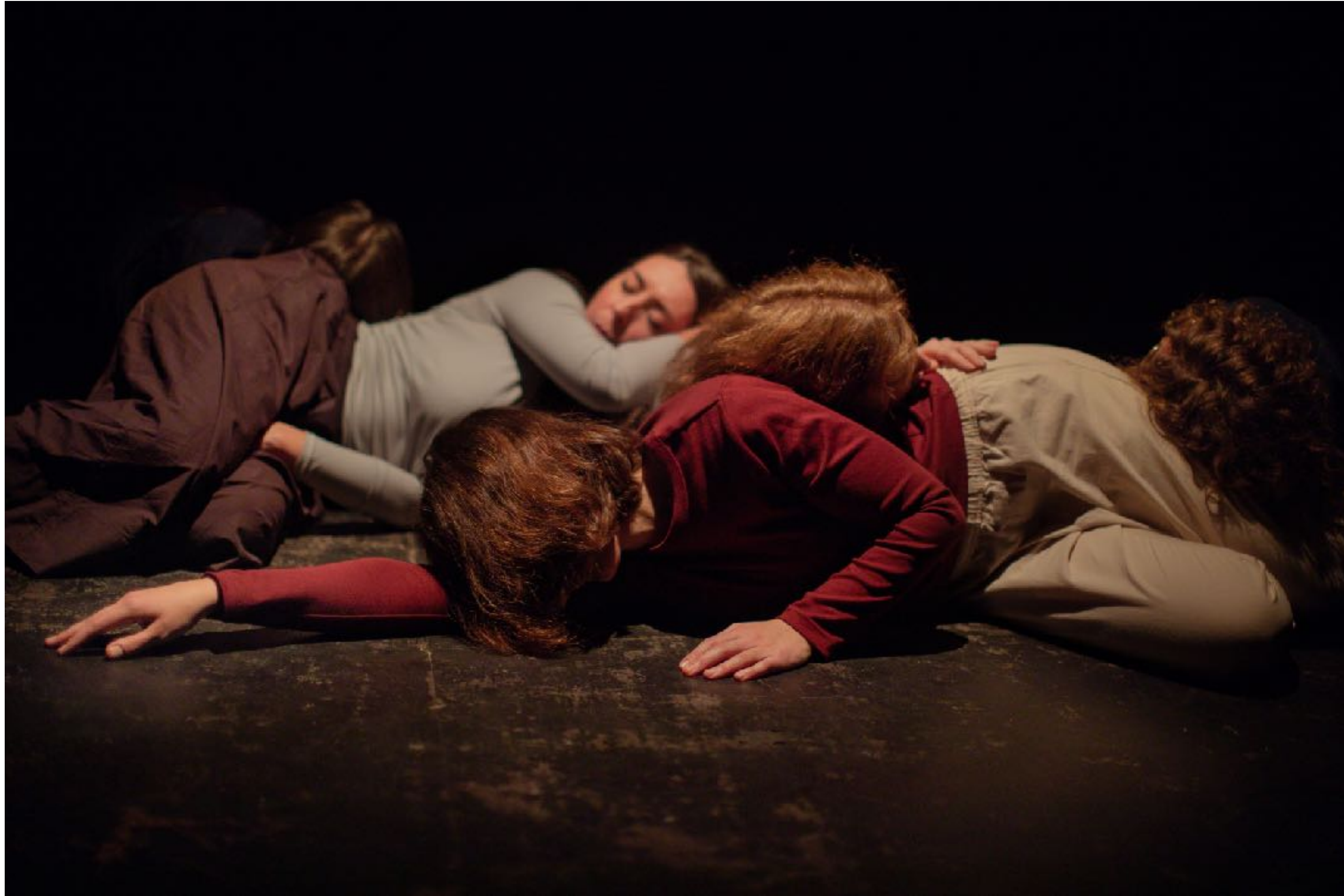
"Pascol" vocal performance at Camden Peoples Theatre