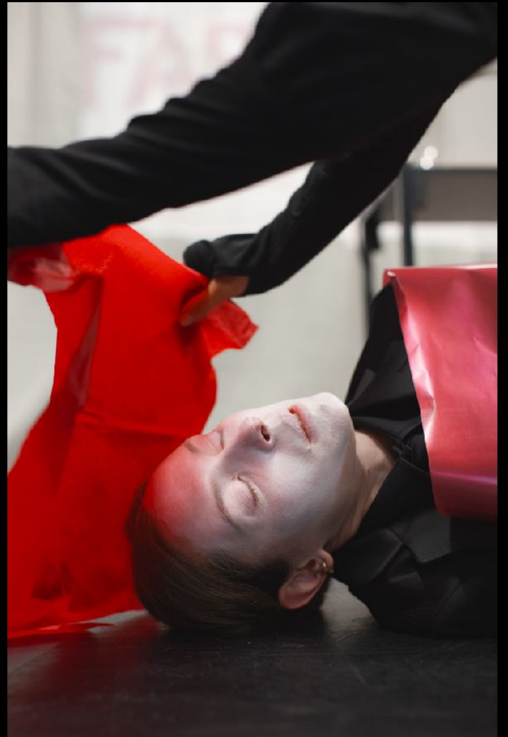
"The World of Yesterday" Stefan Zweig Camden Peoples Theatre