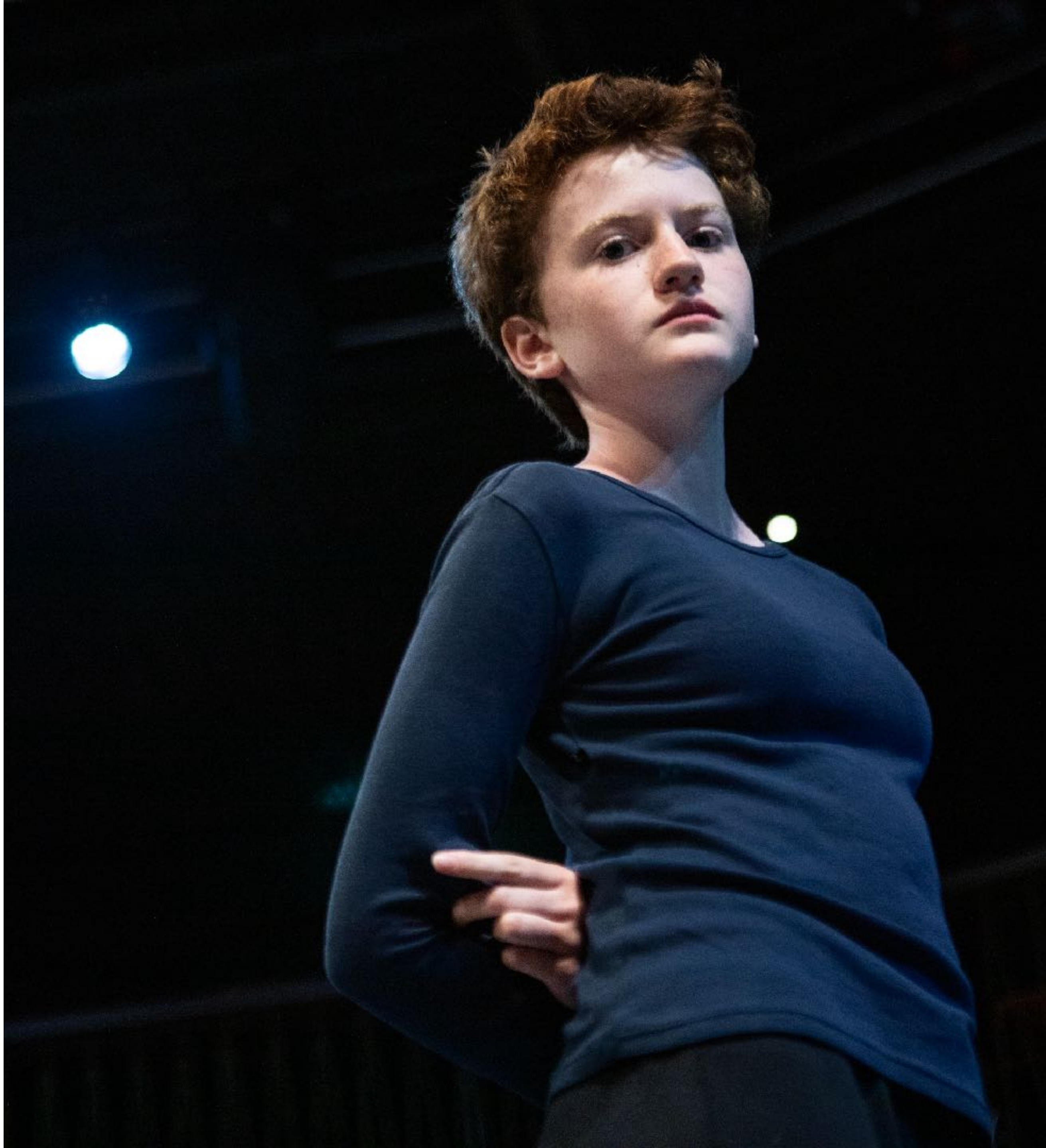
Sounds like chaos at The Albany theatre