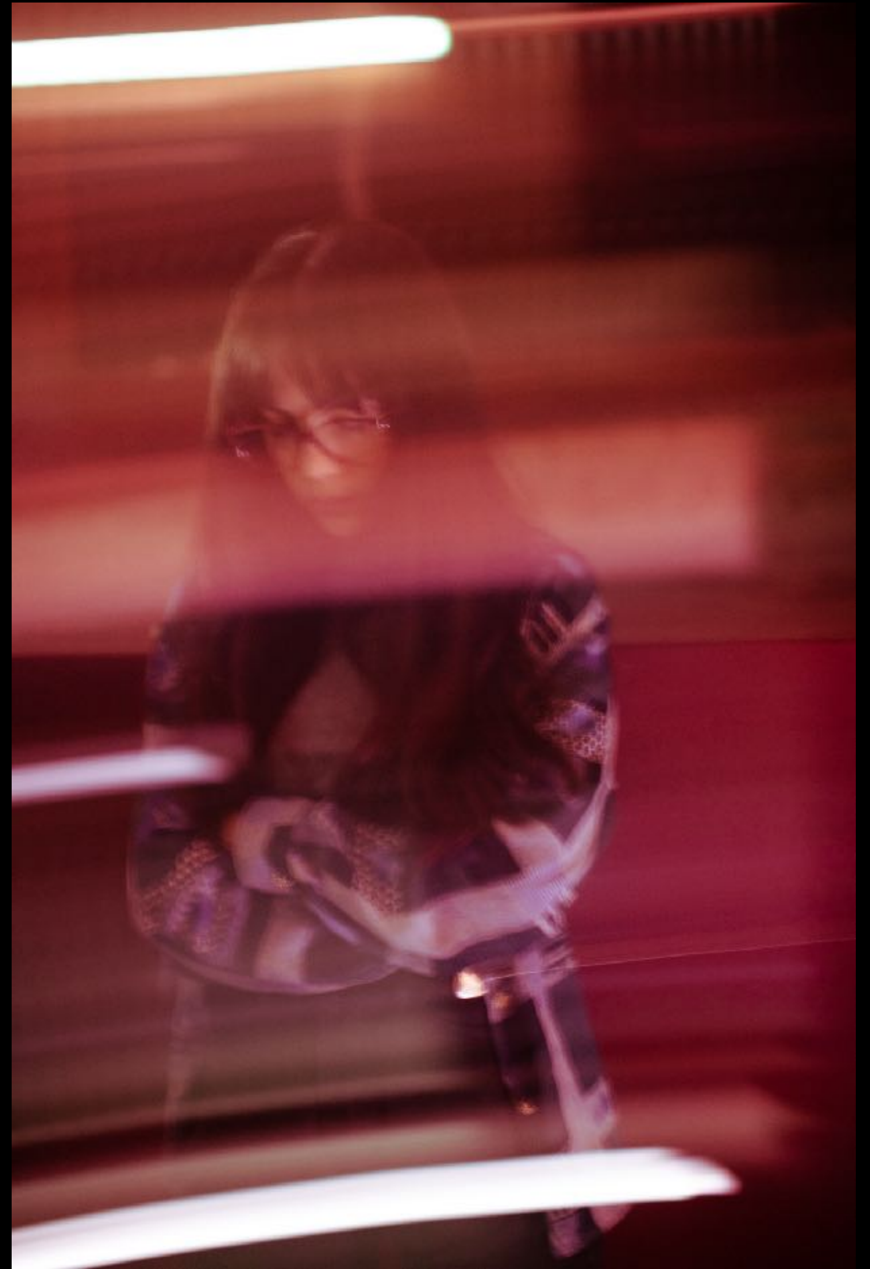
4D SOUND residence at Stone Nest Theatre